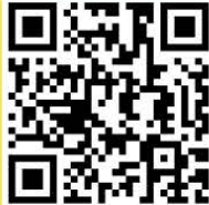
MY VOTER PAGE

You can check your Election Day polling location by visiting the State-run My Voter Page.