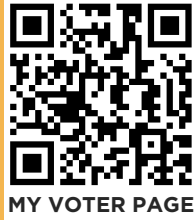
MY VOTER PAGE

The following polls have been collocated: